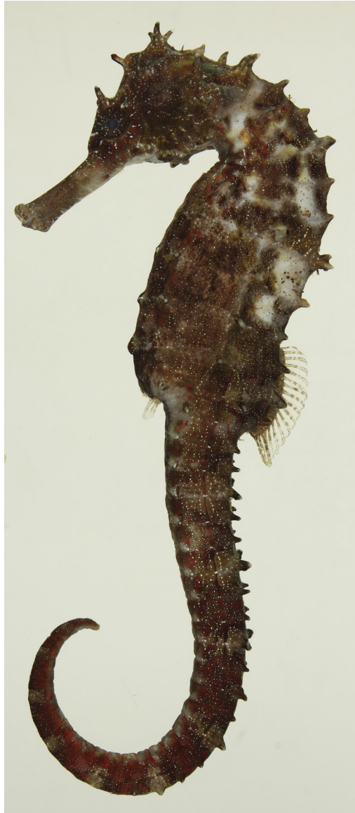
Fig. 2. Hippocampus histrix , KAUM-I. 80297, 193.9 mm TL, off Mihama, Tanega-shima island.

Materials examined. 3 specimens (66.0–230.6 mm TL). KAUM-I. 62299, 66.0 mm TL, Uchinoura Bay, Kimotsuki (31°17'N, 131°05'E), 19 June 2014, set net, K. Koeda; KAUM-I. 80296, 230.6 mm TL, KAUM-I.