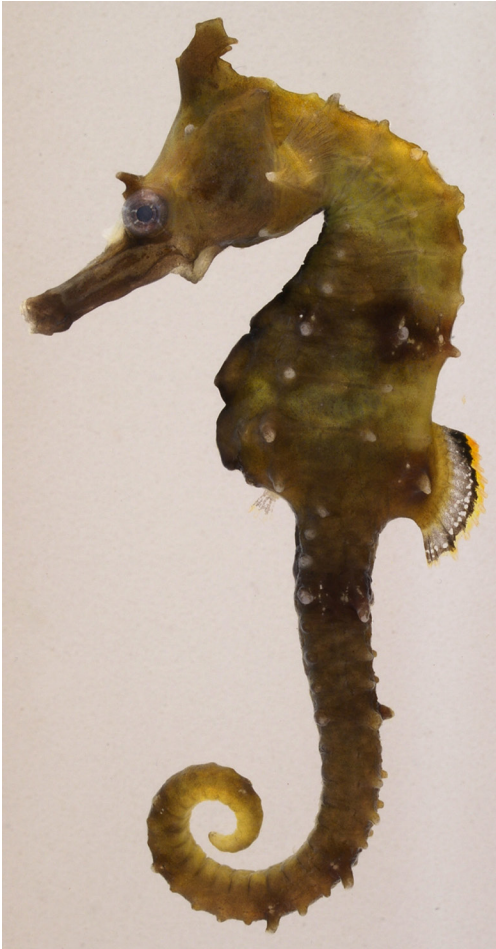
Fig. 1. Hippocampus coronatus , KAUM-I. 12746, 92.1 mm TL, off Nagashima Station, Izumi.

Distribution. Japan (Pacific and Japan Sea coasts from Aomori to Wakayama prefectures, and Aomori to northern Kagoshima prefectures, respectively, and southern Korea (Senou, 2013; Lourie et al., 2016). In Kagoshima Prefecture, this species has been reported from Naga-shima island, Izumi, northwest coast of Satsuma Peninsula (Senou, 2013; this study) and Kasasa, west coast of Satsuma Peninsula (this study).