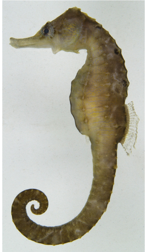
Fig. 6. Hippocampus trimaculatus , KAUM-I. 25542, 72.7 mm TL, Kasasa, Minami-satsuma.

Materials examined. 12 specimens (38.9–183.0 mm TL). KAUM-I. 77492, 151.7 mm TL, Uchinoura Bay, Kimotsuki (31°17'31"N, 131°04'49"E), 5 Aug. 2015, set net, 30–35 m, K. Koeda et al.; KAUM-I. 80379, 183.0 mm TL, Uchinoura Bay, Kimotsuki (31°16'55"N, 131°04'49"E), Aug. 2015, set net, 30–35 m, T. Yanagigawa; KAUM-I. 1800, 179.2 mm TL, off Kasasa, Minami-satsuma (31°25'44"N, 130°11'49"E), 28 May 2006, set net, 27 m, M. Itou; KAUM-I. 9300, 61.3 mm TL, KAUM-I. 9301, 38.9 mm TL, KAUM-I. 25542, 72.7 mm TL, off Kasasa, Minami-satsuma (31°25'44"N, 130°11'49"E), 20 Sep. 2007, 13 Oct. 2007, and 22 Dec. 2009, set net, 27 m, M. Itou; KAUM-I. 97158, 174.6 mm TL, off Kasasa, Minami-satsuma (31°25'44"N, 130°11'49"E), 26 Dec. 2016, set net, 27 m, M. Itou; KAUM-I. 58709, 131.5 mm TL, off Bandokorobana National Park, Minamikyushu (31°14'N, 130°26'E), 2013, gill net, S. Katou; KAUM-I. 6852, 130.0 mm TL, off Chiringa-shima island,