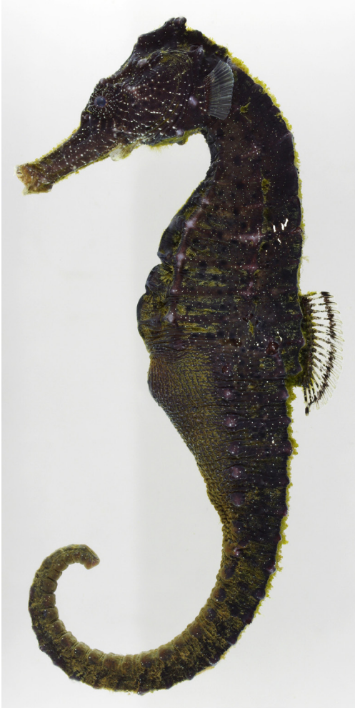
Fig. 4. Hippocampus kuda , KAUM-I. 54118, 156.3 mm TL, Shimama Port, Tanega-shima island.