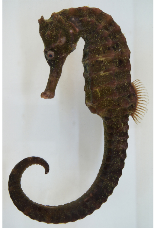
Fig. 3. Hippocampus kelloggi , KAUM-I. 11013, 350.0 mm TL, Sashiki Island, Minami-satsuma.

Materials examined. 14 specimens (44.8–208.7 mm TL). KAUM-I. 19889, 135.0 mm TL, Uchinoura Bay, Kimotsuki (31°17'N, 131°05'E), 5 Oct. 2007, set net, M. Yamada; KAUM-I. 35632, 48.6 mm TL, Kurose Port, Minami-satsuma (31°22'29"N, 130°10'06"E), 18 Sept. 2010, hand net, 4 m, M. Itou; KAUM-I. 58710, 172.0 mm TL, KAUM-I. 58711, 136.9 mm TL, KAUM-I. 58712, 130.5 mm TL, KAUM-I. 58713, 78.5 mm TL, off Bandokorobana National Park, Minamikyushu (31°14'N, 130°26'E),